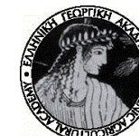
Hellenic Agricultural Academy